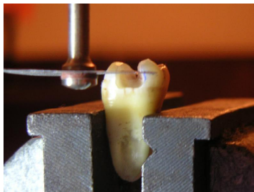
Figure 1. Tooth fixed on holder to facilitate sectioning.

All cavities were cross-sectioned perpendicularly to the tooth axis at the occlusal third of the crown using a diamond wheel cutter with water-cooling to avoid injury to the dentin. The tooth was placed in a jig to avoid movement of the sample during cutting (Figure 1). Cavity sections were flattened and smoothed with sandpaper of 400, 500 and 600 grit in a universal polishing machine. The sections were then embedded in a chemically-cured acrylic resin so that the occlusal surface was exposed to external surface. The blocks were soaked in a container filled with distilled water with few crystal of thymol, immediately at the dough stage of polymerization of the resin. At the doughy stage the temperature rise as a result of the auto curing is very low 25,26 and it will not affect the tooth tissues. After polymerization of the resin, each block was smoothed with sandpaper of 400, 500 and 600 grit. The blocks were kept in distilled water containing thymol 0.1% at room temperature until hardness measurement is completed within 24 hours.